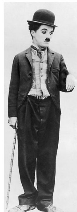
▲ Dressed in a ragged suit and oversize shoes, Charlie Chaplin's little tramp used gentle humor to get himself out of difficult situations.

The advances in transportation and communication that followed the war had brought the world in closer touch. Global prosperity came to depend on the economic well-being of all major nations, especially the United States.